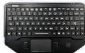
Keyboard with Smartcard Reader