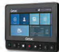
5" Display Controller